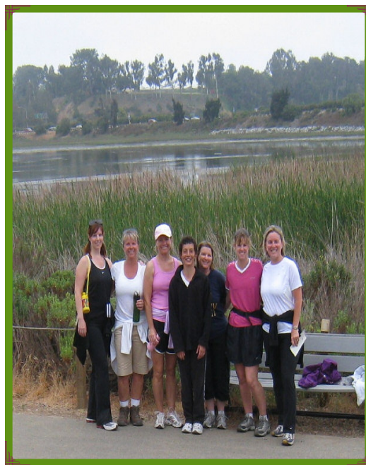
Last month's first hike at the lagoon was great fun and good exercise!